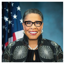
SECRETARY MARCIA L. FUDGE U.S. Department of Housing and Urban Development Arnold R. Pinkney Award for Civic Leadership